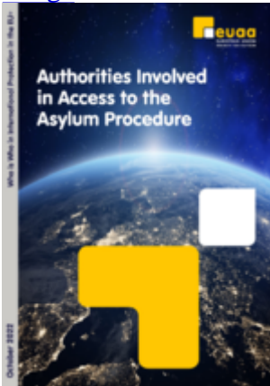
Authorities Involved in Access to the Asylum Procedure Image