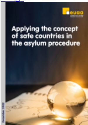
Applying the Concept of Safe Countries in the Asylum Procedure