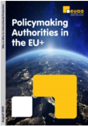
Policymaking Authorities Image