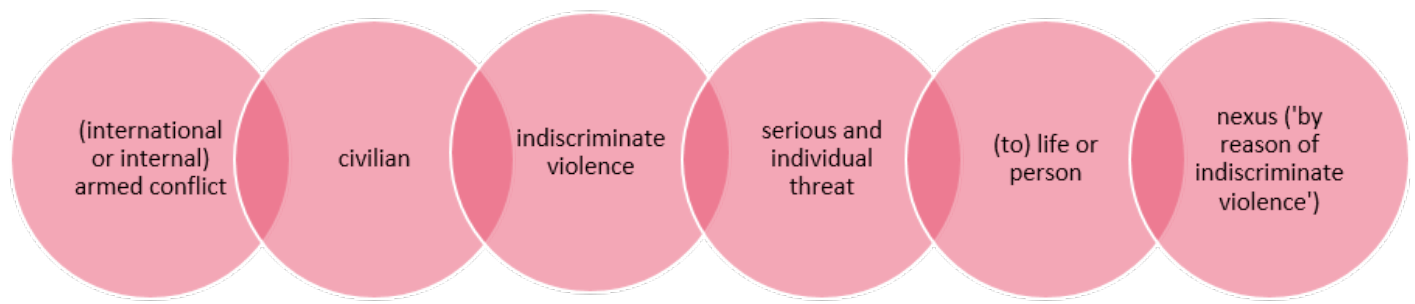
Figure 2. Article 15(c) QD: elements of the assessment.

In order to apply Article 15(c) QD the above elements should be established cumulatively.